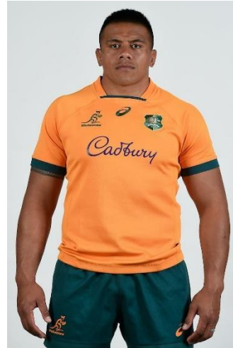
ALLAN ALA'ALATOA CAPTAIN AUST 2023