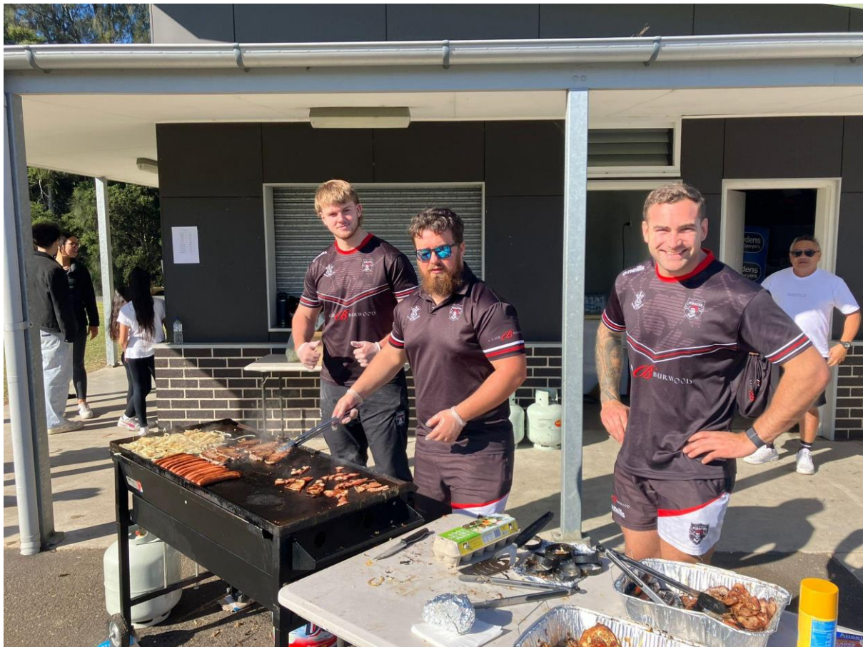
Club Spirit – Colts and Grade supporting Juniors