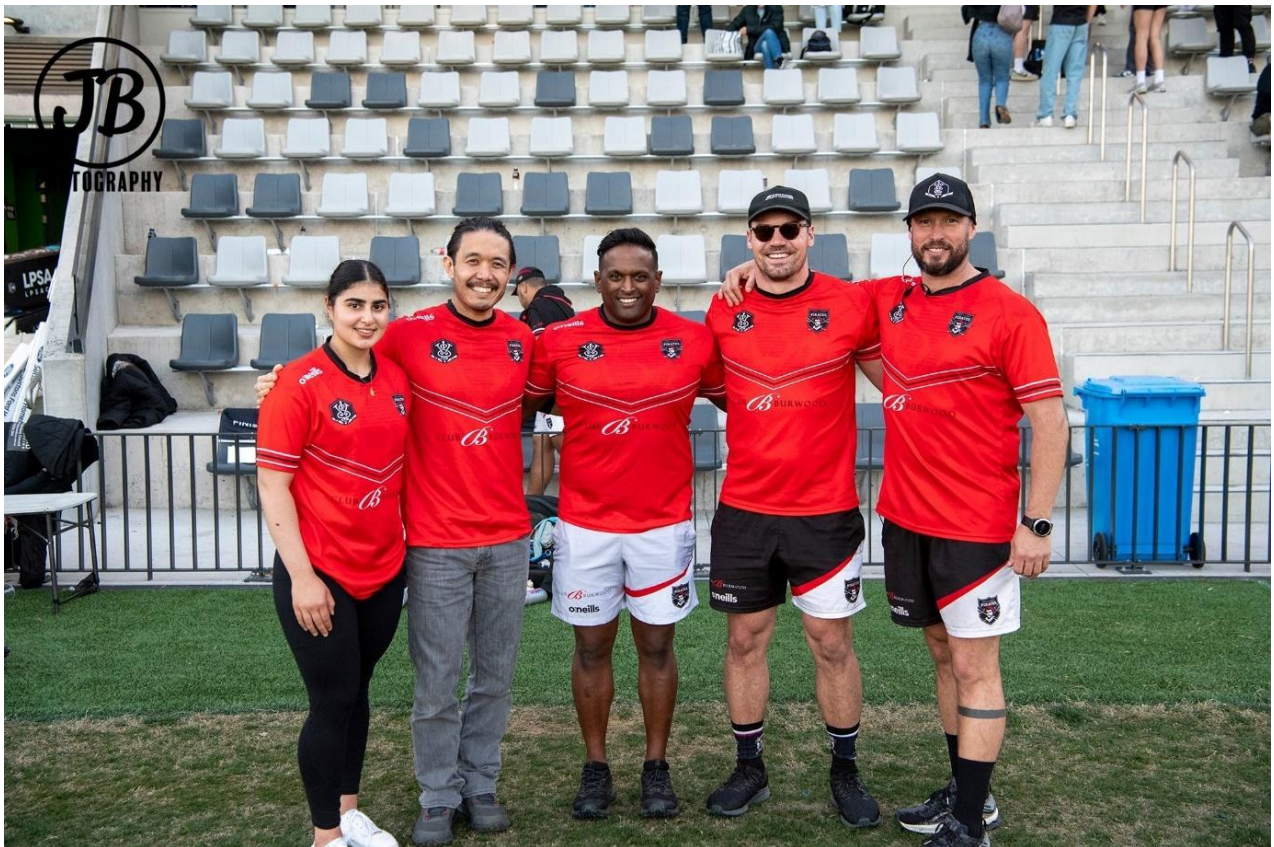
The medical support team