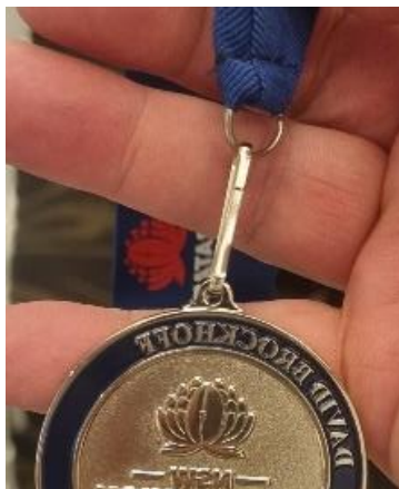
David Brockhoff Medal