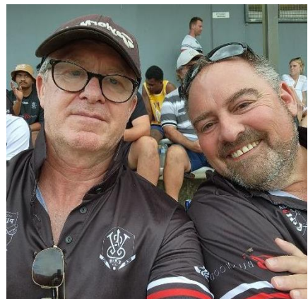
Treasurer and GM